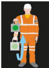
Slowly move away from the machine controller