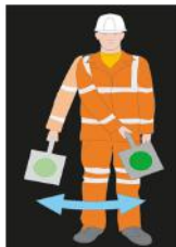
Slowly move towards the machine controller